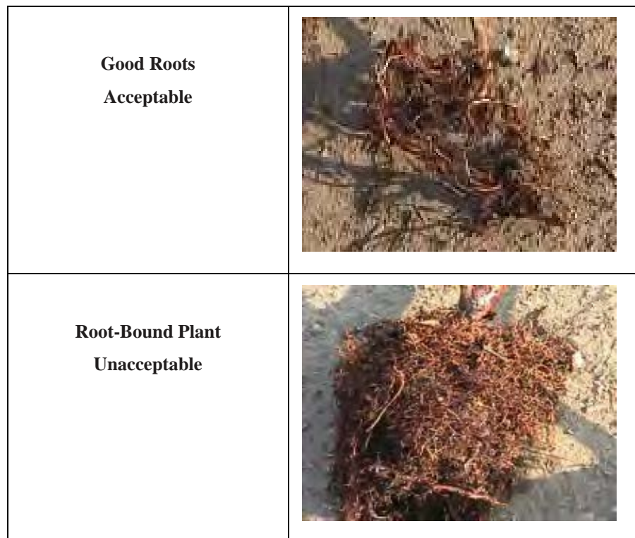
Figure 4-20.1 Roots